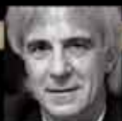
NEY ROSAURO M226 For full and extremely rich sound throughout the keyboard.