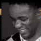
STEFON HARRIS M36 Redesigned for improved playability! Articulate while producing a full fundamental and a beautiful, lyrical sound.