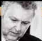
ED SAINDON M38 Full sound and exceptional clarity at all dynamic levels.