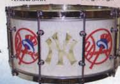
Custom New York Yankees Snare Drum

RCI SD 125 Strainer RCI SD 126 Butt Plate RCI SD 127 Claw Hook RCI SD 128 T-Rod RCI SD Tom Lugs