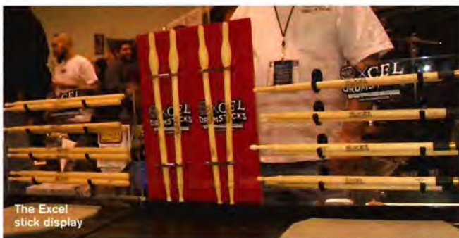
The Excel stick display

And that – as they say – was the 2007 NAMM show, folks. ■