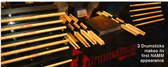
3 Drumsticks makes its first NAMM appearance