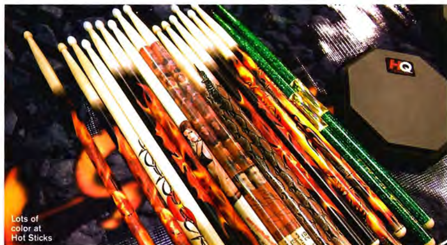
Lots of color at Hot Sticks