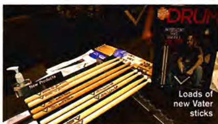
Loads of new Vater sticks