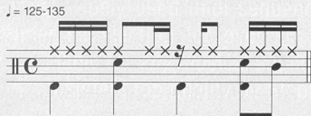
Ex. 6. A noise shot on the second half of the fourth beat keeps this pattern moving.