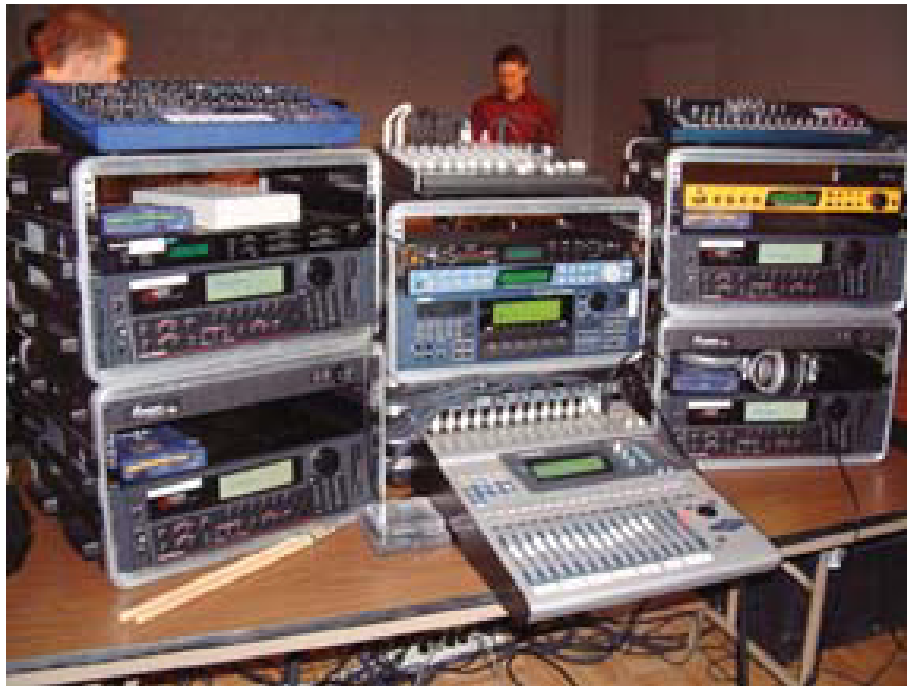
CrossTalk's collection of sound modules used during the shooting of “Alias: The Videos”

Attention to the subtleties of sound is a trademark of any accomplished musician. The ability to control and manipulate sound requires the ability to listen critically and identify sonic nuances to a fine degree. By spending time shaping electronic sounds, students can hone listening skills that then transfer well to the acoustic realm. Choosing the appropriate sound in an electronic context is similar to the challenge of choosing the right triangle or cymbal; the instrument that sounds best